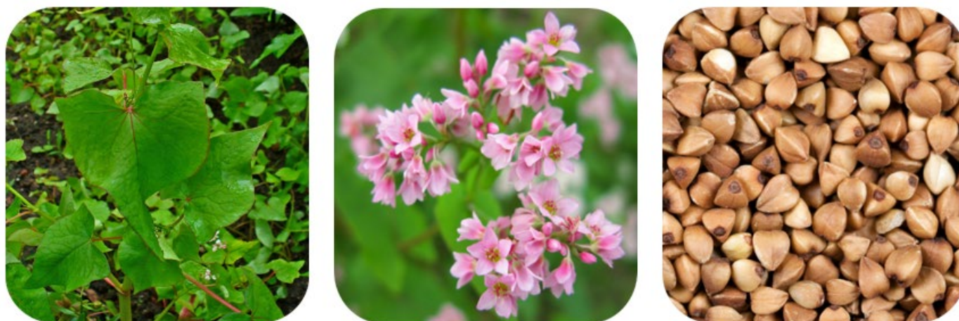
Figure 2. Plant, flowers, and seeds of buckwheat.

Buckwheat is an annual crop with a short development cycle, from 30 to 90 days, which is part of the Polygonaceae family, the Fagopyrum genus comprising 30 species [39–41]. Buckwheat has similar characteristics to cereals such as barley or wheat in terms of chemical composition and edibility, but as it does not belong to the family Poaceae is a pseudocereal with differences in grain structure [27,42]. Barley and wheat are monocotyledonous plants, while buckwheat is a dicotyledonous plant. This implies that the triangular buckwheat fruits, similar to those of the beech, have the embryo with two S-shaped cotyledons instead of a cotyledon, and the core reserve compounds are located differently (Figure 2) [42–44]. Buckwheat is not related to wheat, and its name is probably related to its triangular seeds and the fact that it has similar uses to wheat [45].