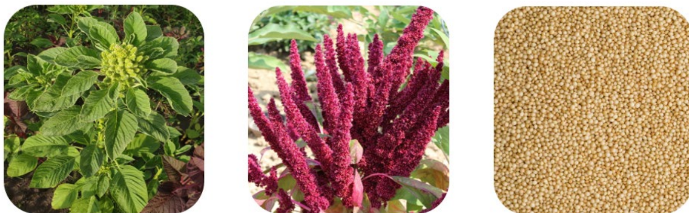
Figure 3. Plant, flowers, and seeds of amaranth.

Amaranth belongs to the order Caryophyllales , family Amaranthaceae , subfamily Amaranthoideae , genus Amaranthus , with about 65–70 species, divided into four classes (cereals, vegetables, ornamentals and weeds) which are naturally found in temperate and tropical regions worldwide, mainly on the American continent, at altitudes that vary between sea level and over 3000 m [32,59–62]. Like buckwheat, it is a pseudocereal, and an annual dicotyledonous plant, with most species originating from Central and South America (Figure 3) [59,63]. Amaranth is currently widely grown all over the world, but mainly in Canada, Mexico, Russia, India, Nepal, China, Indonesia, Malaysia, the Philippines, Kenya, Argentina, Peru, and Australia [35,64]. The world’s largest producer is China [64,65]. Presently, the main consumer market for amaranth seeds is Germany [64].