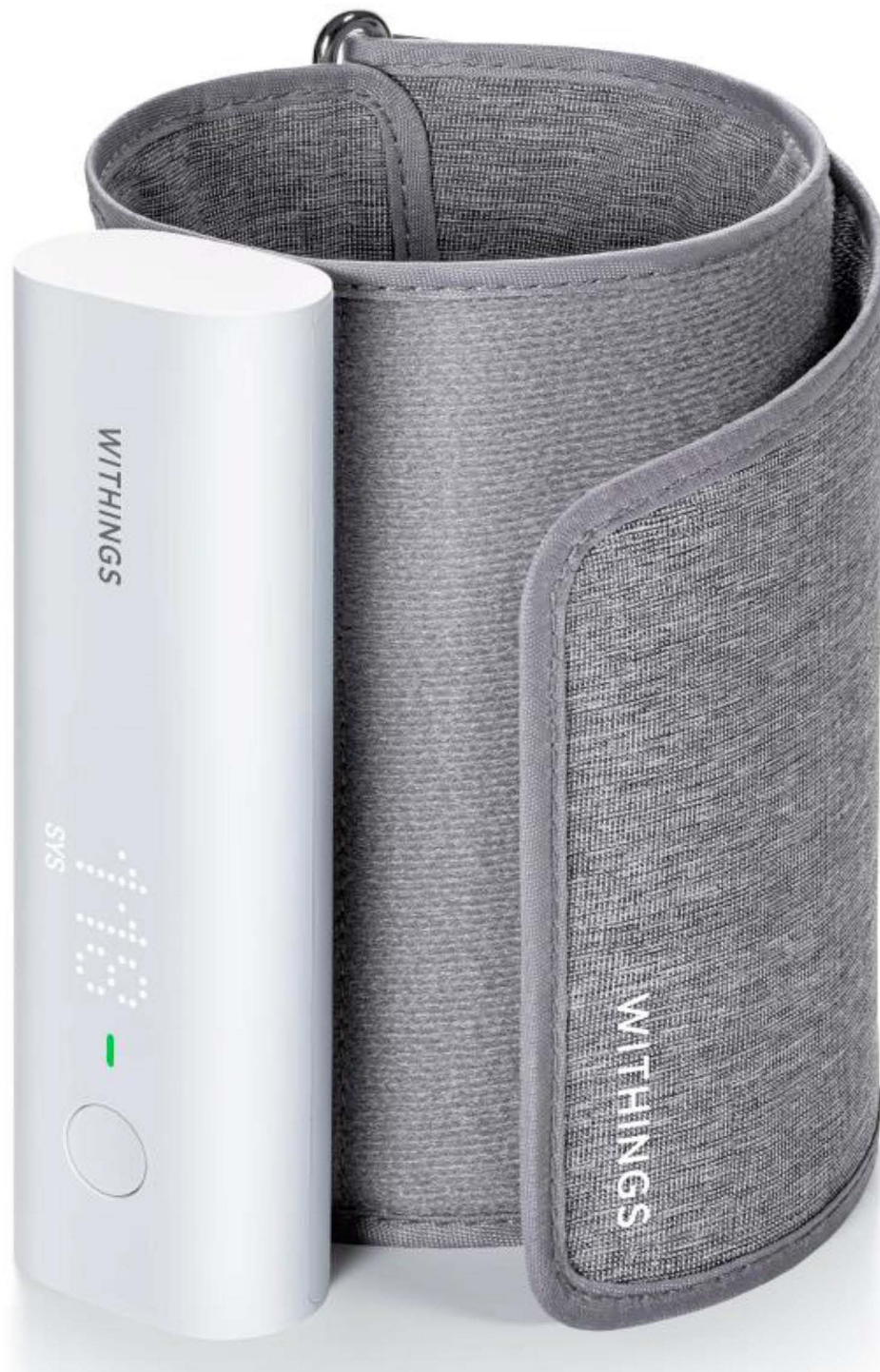
Figure 1 The Withings BPM Connect device.

mmHg (systolic: 60–230 mmHg, diastolic: 40–130 mmHg) and pulse rate range of 40–180 beats/min. At the end of BP determination, a fast cuff deflation is performed using a release valve. The device includes: