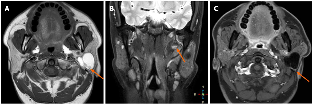
DOI: 10.12998/wjcc.v10.i8.2622 Copyright © The Author(s) 2022.