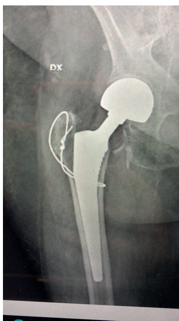
Figure 2. Periprosthetic fracture (A according to Vancouver classification) treated with cerclage wire.

Femur fracture in elderly people presents high risk of mortality at one-year follow-up. In a study conducted by Eiskjaer (13) the mortality rate after six months was 20% reaching value of 28% at 1 year follow-up. Many factors such as cardio-pulmonary comorbidities, serum creatinine level > 1.7 mg/100 ml,