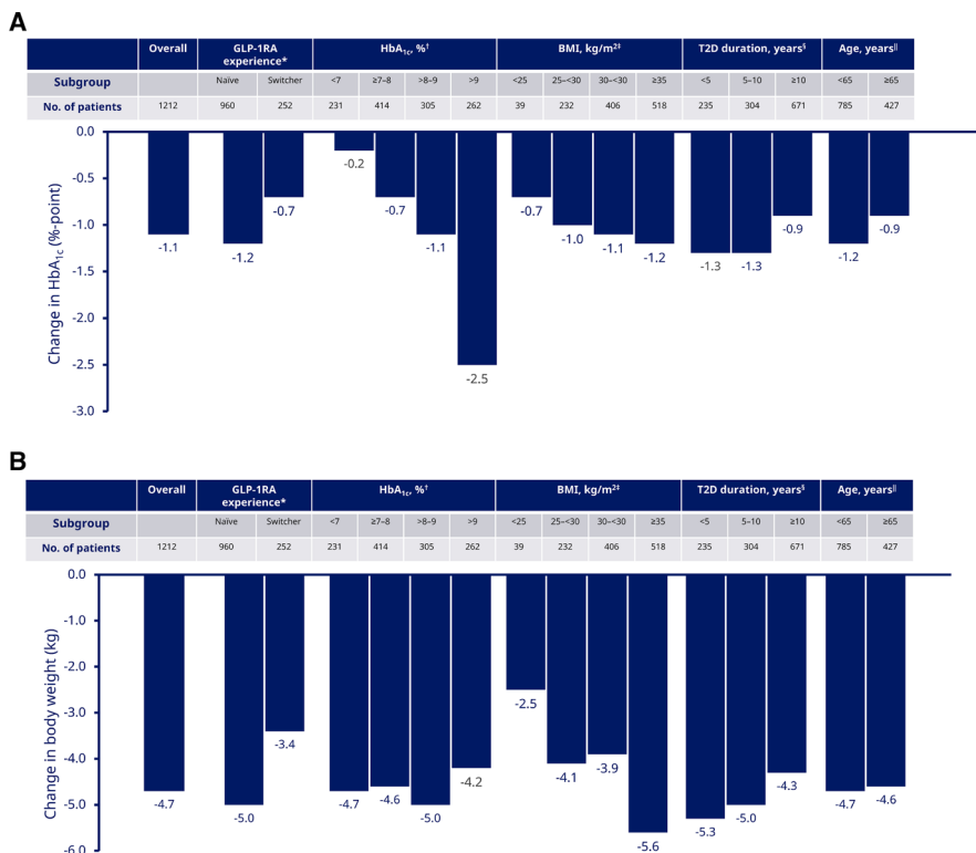
Figure 1 (A) Change in HbA 1c from baseline to EOS in overall population and subgroups; (B) change in body weight from baseline to EOS in overall population and subgroups. Data are from the full analysis set, in-study period that represents the time period during which patients are considered to be in the study, regardless of semaglutide treatment status. Response was analyzed using baseline T2D duration, age, BMI, time, time-squared, preinitiation use of DPP-4i, preinitiation use of insulin, preinitiation use of GLP-1RAs, GLP-1RA (except in ‘GLP-1RA experience’ subgroups), number of OADs used preinitiation (0–1/2+) and sex with random intercept and random time coefficient (slope). (A) All p values for change from baseline to week 30 are significant at <0.0001. Interaction p value for difference between subgroups: *p=0.0003; † 0.0209; ‡ 0.9354; § 0.1944; ¶ 0.3504. (B) All p values for change from baseline to week 30 are significant at <0.0001 except p=0.0092 for baseline BMI of 25 kg/m 2 . Interaction p value for difference in change between subgroups: *p<0.0001; † 0.8730; ‡ 0.5791; § 0.8419; ¶ 0.7569. BMI, body mass index; DPP-4i, dipeptidyl peptidase-4 inhibitor; EOS, end of study; GLP-1RA, glucagon-like peptide-1 receptor agonist; HbA 1c , glycated hemoglobin; OAD, oral antihyperglycemic drug; T2D, type 2 diabetes.

dose; 3 (0.3%) were receiving a dose between 0.25 and 0.5 mg; 274 (27.8%) were receiving a 0.5 mg dose; and 13 (1.3%) were receiving a dose between 0.5 and 1.0 mg. The majority of patients (576 (58.5%)) were taking the 1.0 mg dose and 2 (0.2%) were taking a dose >1.0 mg. The use of doses <0.25 mg and between 0.25 mg and 0.5 mg, between 0.5 and 1.0 mg, and over 1.0 mg is off-label and occurred because of the studies’ non-interventional nature.