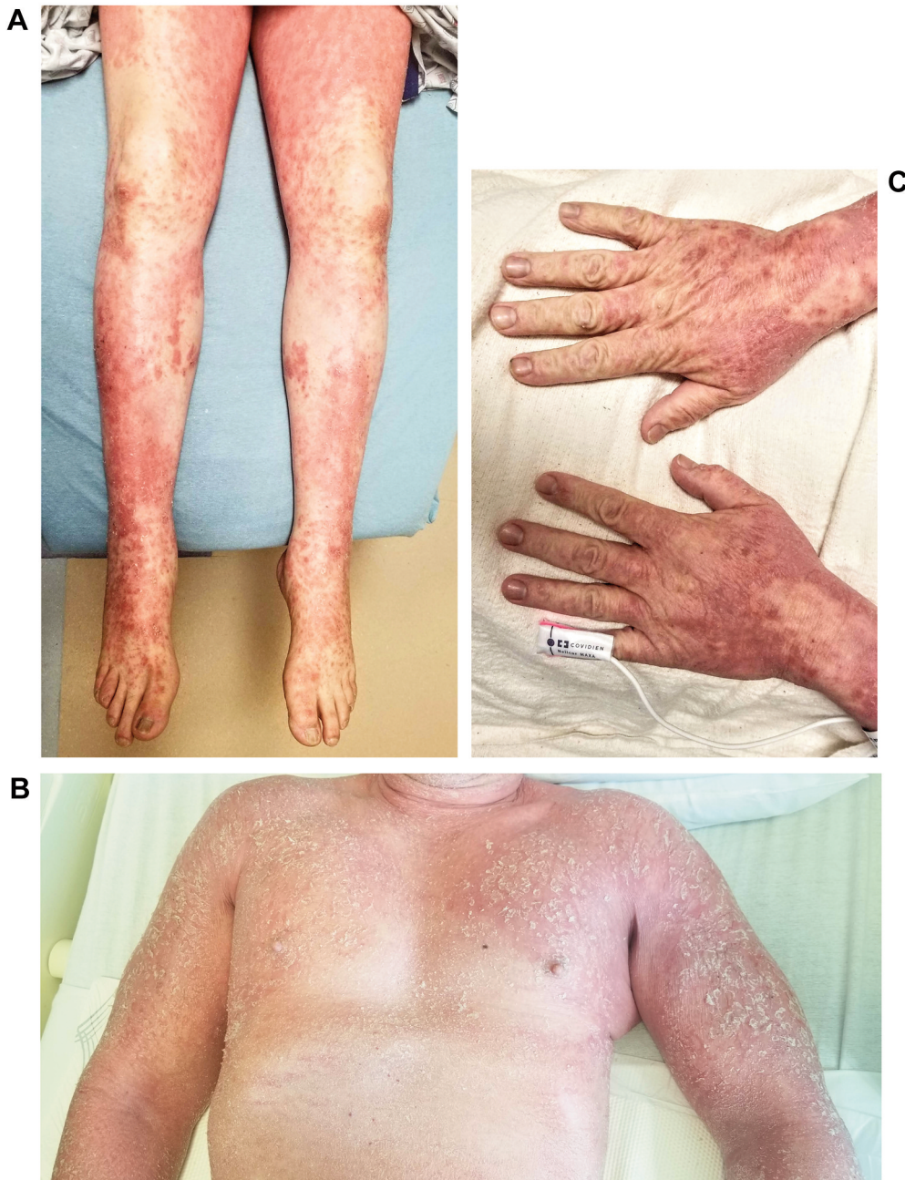
Figure 1. Clinical presentation of diffuse erythroderma on trunk and extremities. A: Diffuse erythematous rash of bilateral dorsal aspect of hands. B: Diffuse erythema and scaling rash over trunk, chest and arms. C: Scaling erythematous rash of lower extremity.

colon, fallopian tube and prostate cancers are reported (12, 19). Most of the time, it is difficult to determine the association of erythroderma and malignancies, however if erythroderma develops insidiously and progressively in the absence of previous skin disease and shows resistance to standard therapy, by that time, an underlying malignancy should be strongly considered (14, 20). After renal cell