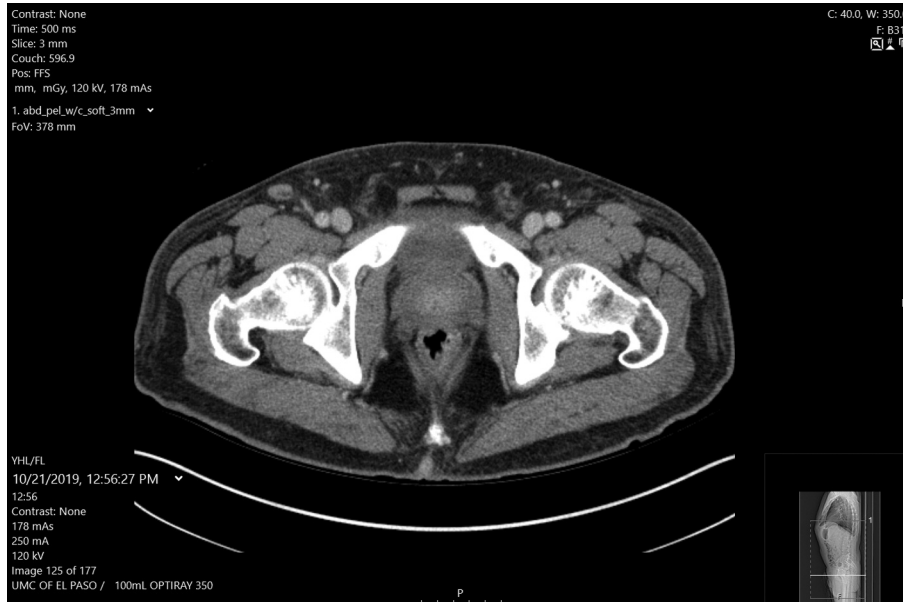
Figure 2. CT scan of abdomen and pelvis showing enlarged prostate gland.