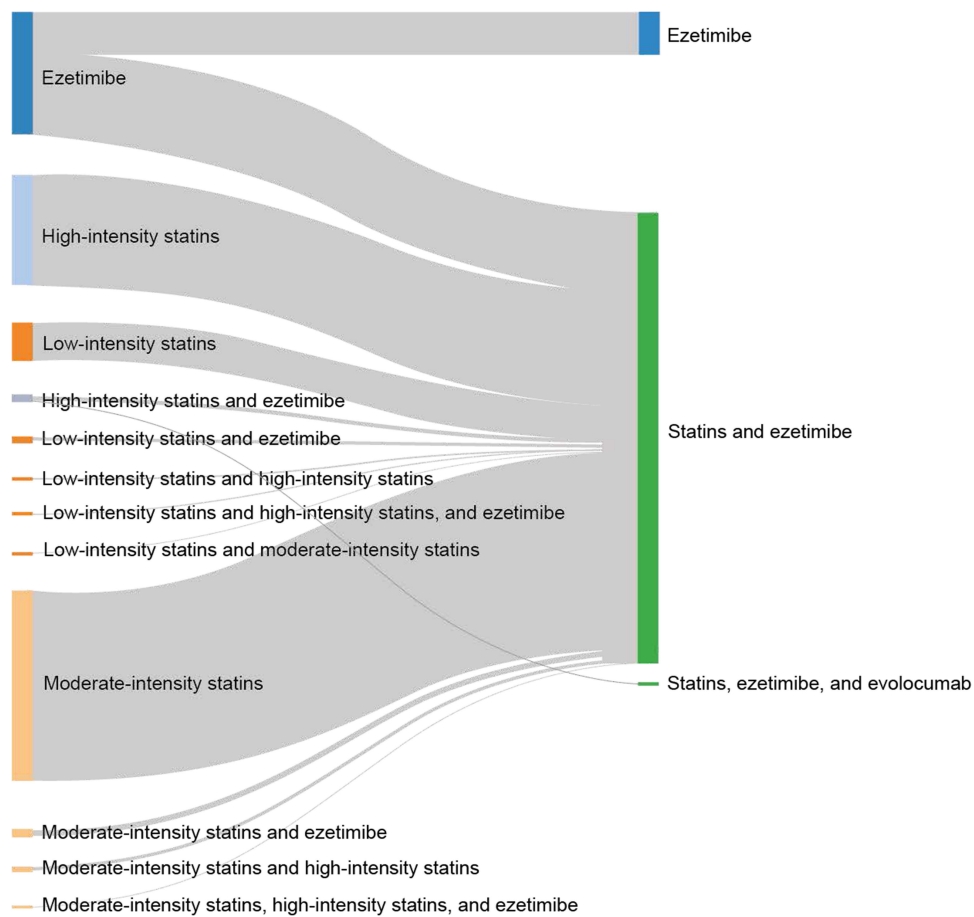
Figure 3 Sankey diagram depicting the sequencing of lipid-lowering treatments. Low intensity, moderate intensity, and high intensity based on drug codes (see also Supplementary table A in Supplementary Appendix A ).