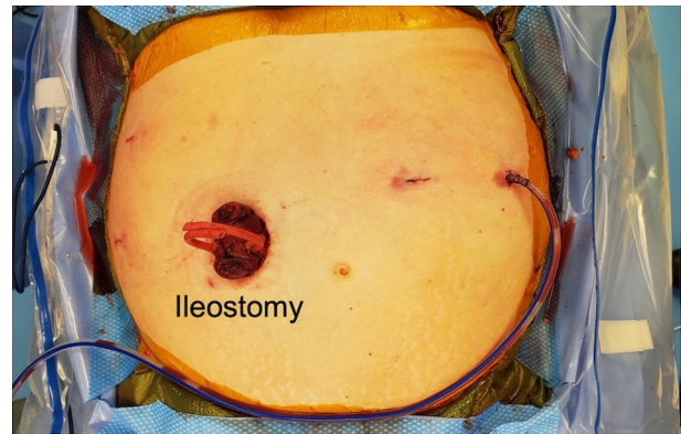
Fig. 2 Conclusion of operation with loop ileostomy creation

Once the distal transection is completed, the proximal transection point is identified and we take the mesentery using the vessel sealer to the wall of the bowel at this point. Perfusion is assessed by instilling indocyanine green using