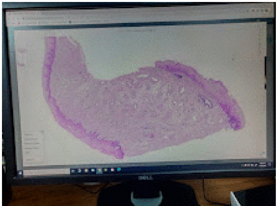
Fig 2. Telepathology working station portal illustrating the digital image of a normal cervical biopsy, H&E staining 20 x original magnification.

https://doi.org/10.1371/journal.pone.0266649.g001