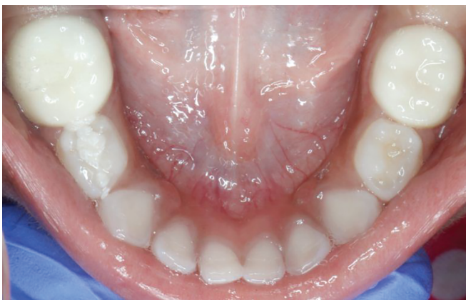
Fig. 2: Preformed zirconia crowns in mandibular second molars

The crowns other than those which showed retention failure had good marginal integrity in both the groups 100% [31/31]