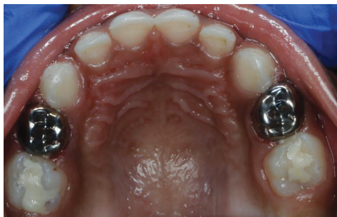
Fig. 1: Stainless steel crown in maxillary molars

sealed using Glass ionomer cement, so as to obtain better bond between the luting cement and access cavity cement.