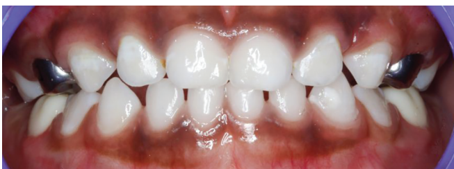
Fig. 3: In occlusion