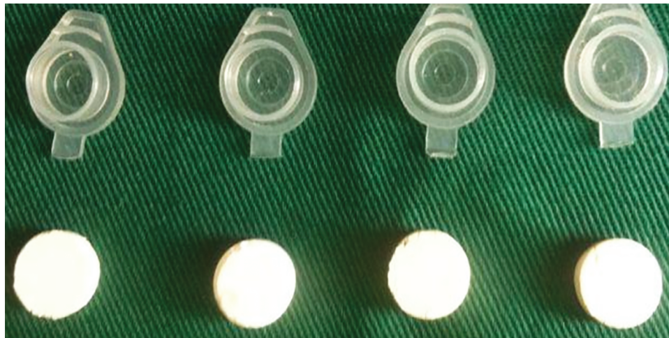
Fig. 1: Specimen preparation

The results of this study about Fuji IX is in accordance with another study results. Low fluoride release in F IX is attributed to glass filler content with fewer monovalent ions cross-linking the