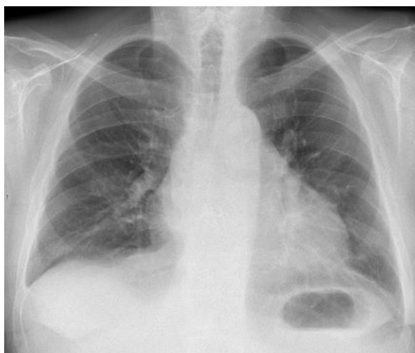
Fig 2. Postoperative chest radiograph showed clear lungs.

of basiliximab on POD 0, but the second dose was held and mycophenolate mofetil was discontinued. He was maintained on tacrolimus and prednisone according to our program’s immunosuppression protocol. He was treated with monoclonal antibody (casirivimab/imdevimab 600mg/600mg) on POD 1 and remdesivir 200 mg for 5 days from POD 2. His postoperative course was uncomplicated and mycophenolate mofetil was restarted on POD 5. His chest radiograph did not show any abnormalities (Fig 2) when he was discharged on POD 14. The explanted lung pathology showed advanced interstitial fibrosis with honeycombing consistent with chronic hypersensitivity pneumonitis. Follow-up COVID-19 PCRs became negative 2 months after transplantation, and the recipient continues to do well without any episodes of acute rejection.