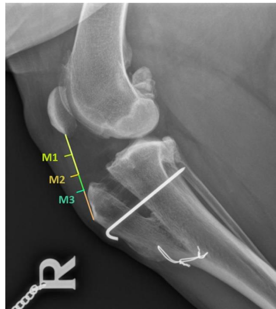
Figure 1. Patellar ligament measurements.

One of the limitations of this study is the absence of ultrasound examination of the patellar ligament.