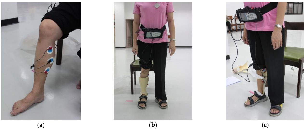
Figure 4. (a) dEMG from the medial gastrocnemius; (b) dEMG from the medial gastrocnemius while wearing an AAFO; and (c) dEMG from the medial gastrocnemius while wearing a PAFO. Abbreviations: AAFO, anterior ankle foot orthosis; PAFO, posterior ankle foot orthosis; dEMG, dynamic electromyography.