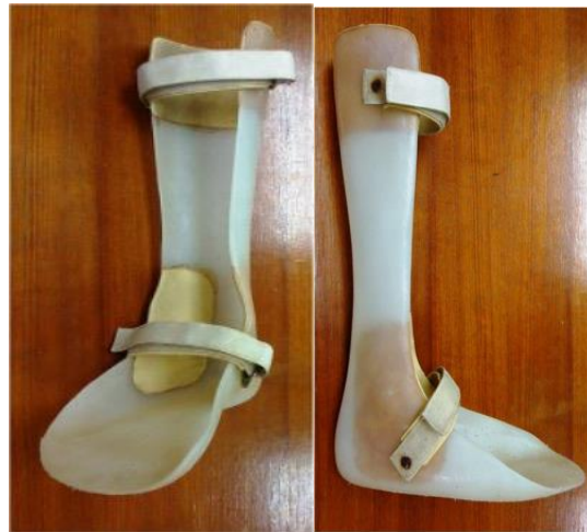
Figure 3. PAFO, posterior ankle foot orthosis.