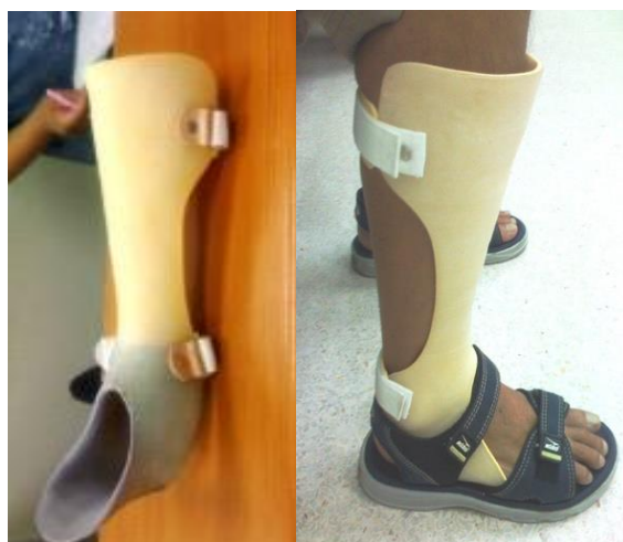
Figure 2. AAFO, anterior ankle foot orthosis.