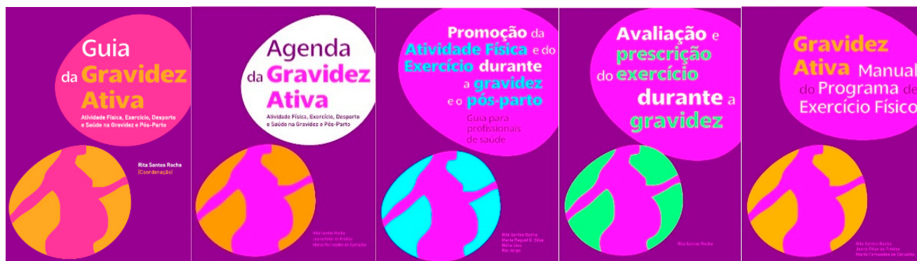
Figure 1. Layout of the educational materials produced with the support of IPDJ—Instituto Português do Desporto e da Juventude (Portuguese Institute of Sport and Youth).

The pilot tests aimed to determine the feasibility and acceptability of the exercise program, and the supporting materials were tested by three groups of participants (Figure 1).