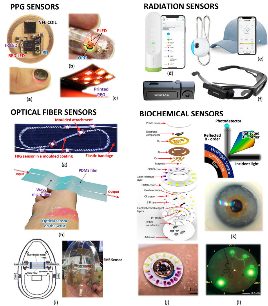
Figure 1. Wearable optical sensors for measuring of human physiology: (a) Miniaturized battery-free NFC enabled wireless systems for wearable pulse oximetry (unencapsulated device and device

Optical sensors are, in principle, detectors that capture the physical amount of light or its variations. In our article, we focus on optical sensors that enable continuous and highly sensitive measurement of parameters about our health and the environment for medical diagnostics and physiological health assessment [11]. Such progressive sensors are manufactured applying fundamental optical technologies such as photoplethysmography (PPG), optical fibers with Bragg gratings (FBG), interferometers often woven in smart textiles, various radiation sensors, plasmonic and fluorometric sensors, and colorimetry, as well as the development of prospective new materials and organic components (Figure 1).