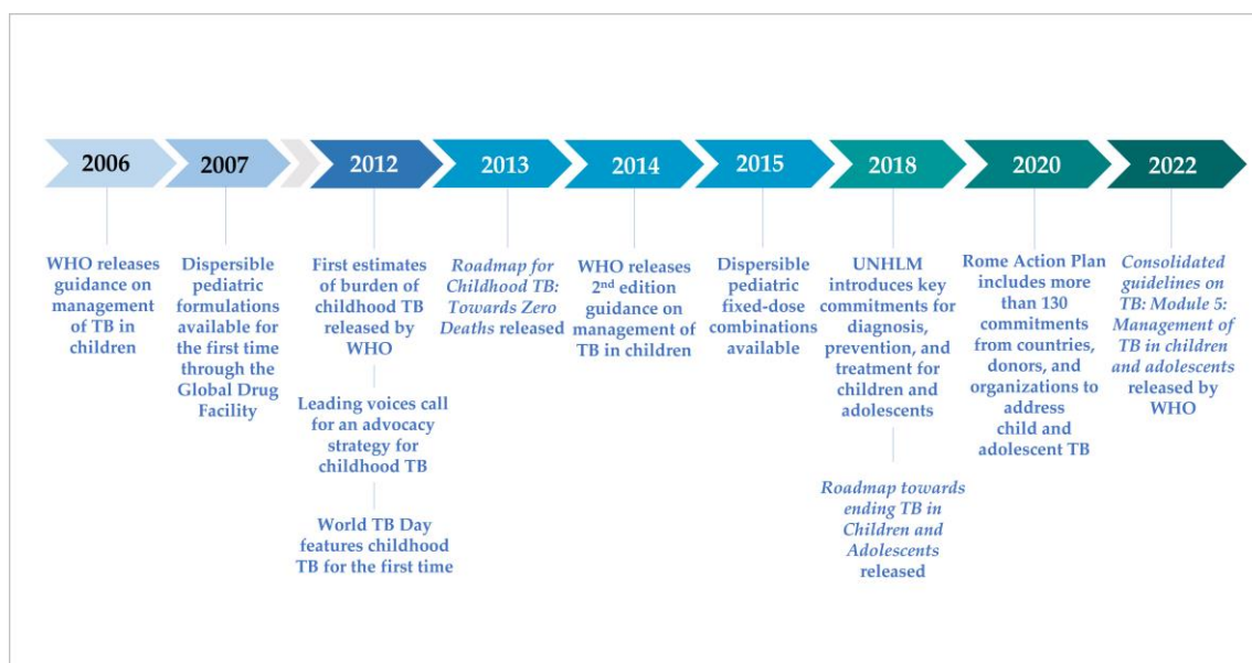
Figure 1. Timeline of key events in advocacy and multilateral action for child and adolescent TB.

practice were established across disciplines and health programs to support implementation of important advances and innovations.