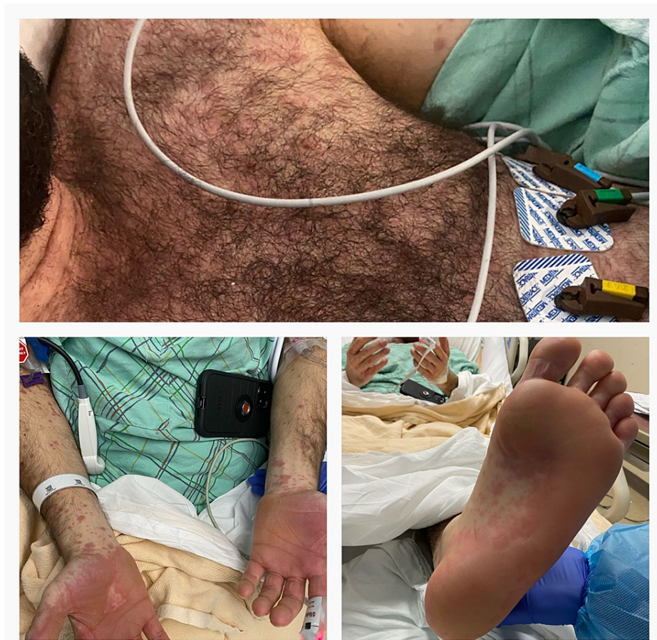
FIGURE 3: Pictorial representation of bullae on chest, hands, and soles.