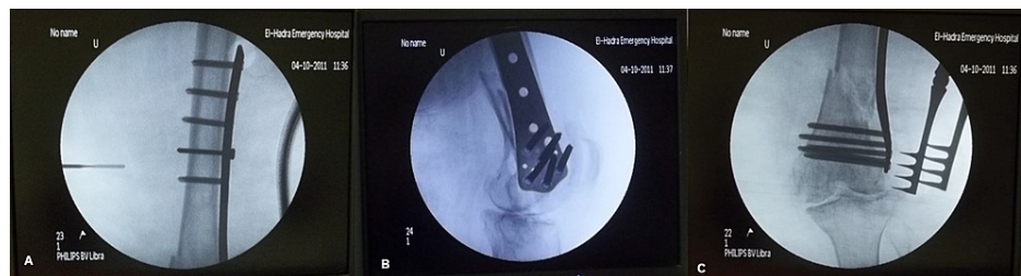
FIGURE 6: Intra-operative fluoroscopy images.

The fracture reduction and the implant position are checked under fluoroscopic guidance (Figure 6A-6C).