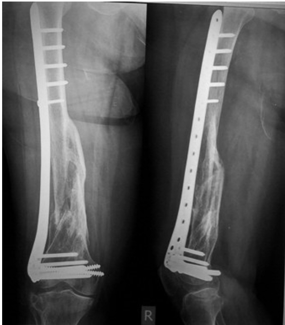
FIGURE 8: Six months post-operative x-rays showing bridging callus formation.

Six months follow-up x-rays show bridging callus with satisfactory alignment in both antero-posterior and lateral views with no signs of implant failure.