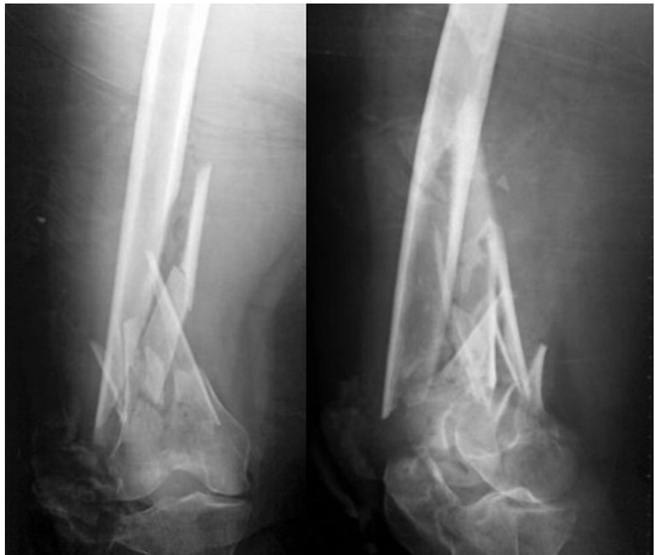
FIGURE 7: Pre-operative x-rays.

X-rays show a comminuted (AO type C2) supra-condylar femur fracture with intra-articular extension.