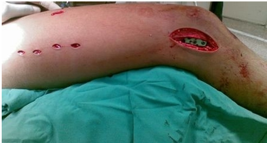
FIGURE 5: Proximal screws are inserted through multiple small incisions.

Postoperative photo demonstrating incisions after the implant has been placed. The lateral distal incision for the insertion of the plate and distal screws, and multiple small proximal incisions for the insertion of the proximal screws.