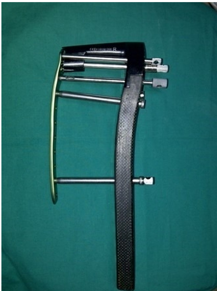
FIGURE 4: The external jig of the LISS.

Assembly of the external jig and the LISS plate. The connecting bolts are screwed through the jig into the distal and proximal parts of the plate to allow for the insertion of the screws using small incisions. LISS: less invasive stabilization system.