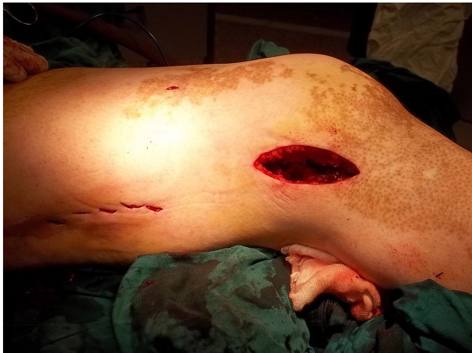
FIGURE 1: Lateral approach to the distal femur.

All patients had the surgery under fluoroscopic guidance in a supine position on a radiolucent table. A towel bump was then placed under the ipsilateral buttock to counteract the normal external rotation of the lower limb. A minimally invasive approach was used after the preparation of the affected lower limb. It was either a direct lateral approach if there was no intra-articular extension, as in AO type A (Figure 1), or an anterolateral approach if there was the intra-articular extension, as in AO type C (Figure 2). All procedures were done with percutaneous sliding of the plate through an anterolateral approach in six patients and a direct lateral approach in 14 patients.