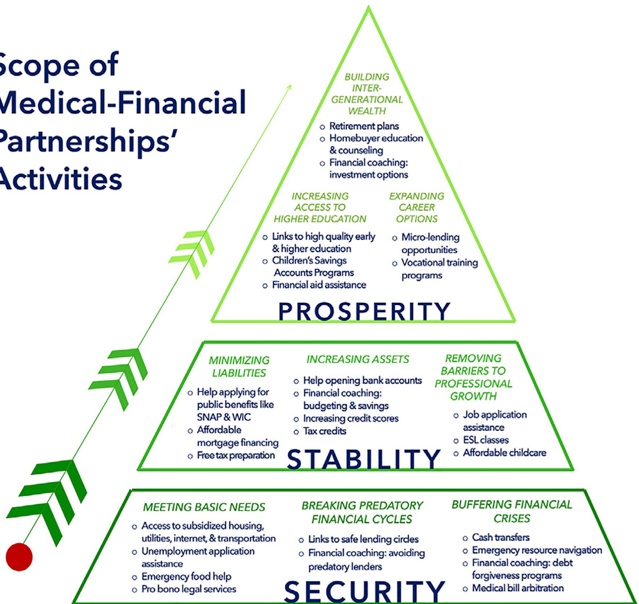
Figure 2. Scope of medical-financial partnerships' activities.