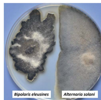
Fig. 1 The growth inhibition of potato endophytic fungus B. eleusines against potato pathogen Alternaria solani on PDA.