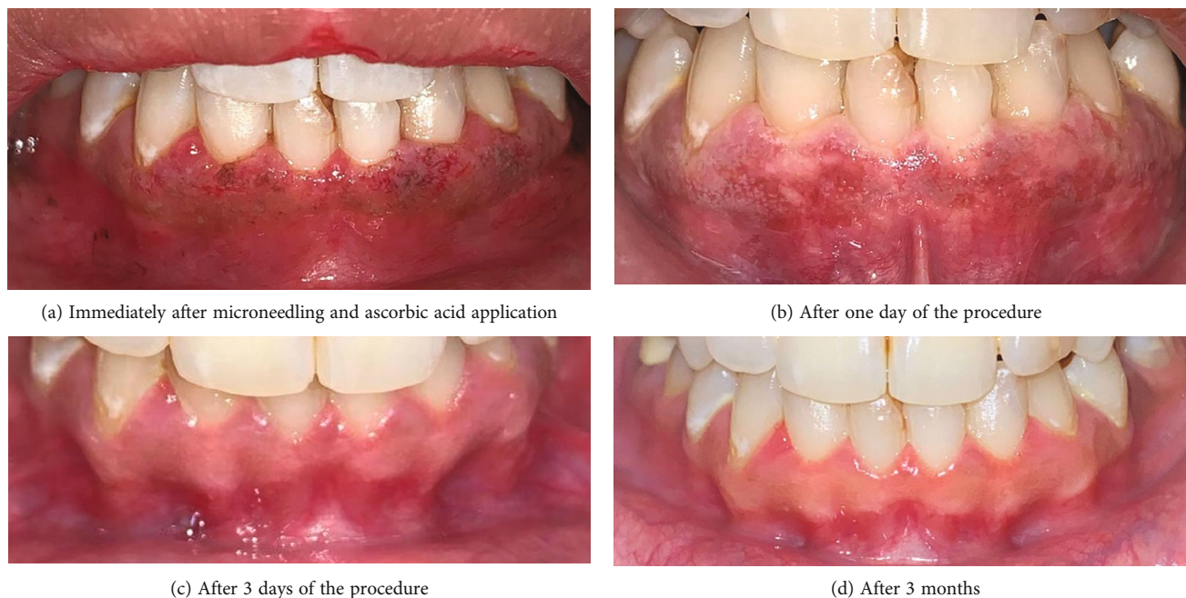
FIGURE 3: (a–d) Postoperative pictures of gingival depigmentation.