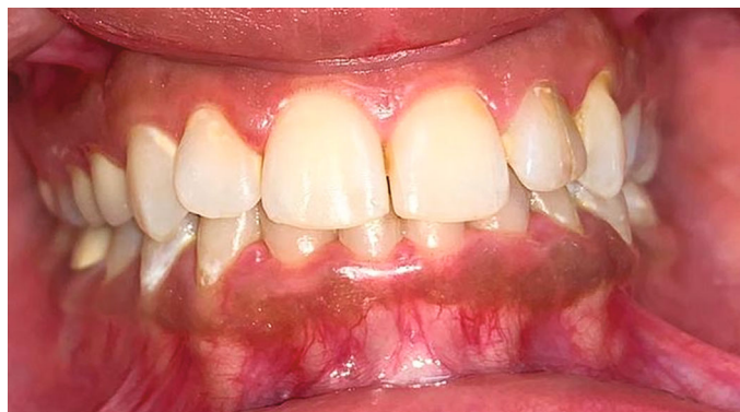
FIGURE 1: Preoperative picture of moderate gingival pigmentation.

pigmentation), score 3 represents medium brown or mixed brown pink and brown pigmentation (moderate pigmentation), and score 4 indicates deep brown or bluish-black pigmentation (heavy pigmentation). In 2017, the American Academy of Periodontology and the European Federation of Periodontology proposed a new classification of periodontal and peri-implant diseases [5] in which gingival colour alterations are diagnosed as “gingival pigmentations” and it was classified into melanoplakia, smoker’s melanosis, drug-induced pigmentations, and amalgam tattoo.