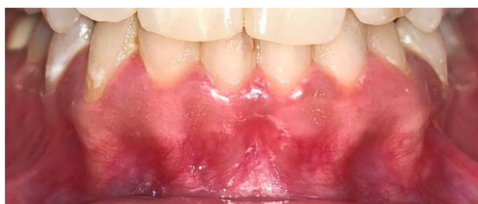
FIGURE 4: Recurrence of gingival pigmentation started after 6 months.

In the present study, the patient agreed and signed explicit written consent for this off-label procedure being used as a part of research. During the procedure, it was necessary to generate precise bleeding pinpoint by MN to achieve optimal results [16]. These microholes allow the therapeutic medication to penetrate easily into the connective tissues, stimulating new collagen production and affecting melanocytes [8].