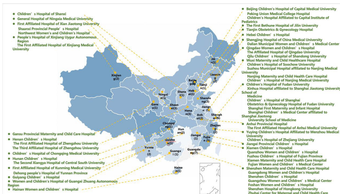
Figure 1 Map of 58 participating hospitals in Chinese Neonatal Network (CHNN). There were 58 member hospitals from 25 provinces in China that are participating in the CHNN. The distribution of the 58 member hospitals is almost geographically throughout the mainland China.

This is a prospective, hospital-based cohort. Data will be collected on all infants <32+0 weeks GA or birth weight <1500 g admitted to participating NICUs. Still-born, delivery room death and infants transferred to non-participating hospitals within 24 hours after birth will be excluded. Re-admissions and transfers between participating hospitals will be tracked as data from the same