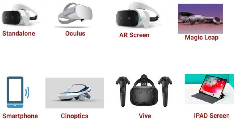
Fig. 3 AR/VR devices.

The global health resistance to viruses has by far been stretched due to the spread of COVID-19. In 2018, the global investment in AR/VR worthed $641 million and increased to $3.8 billion in 2020 due to COVID-19.