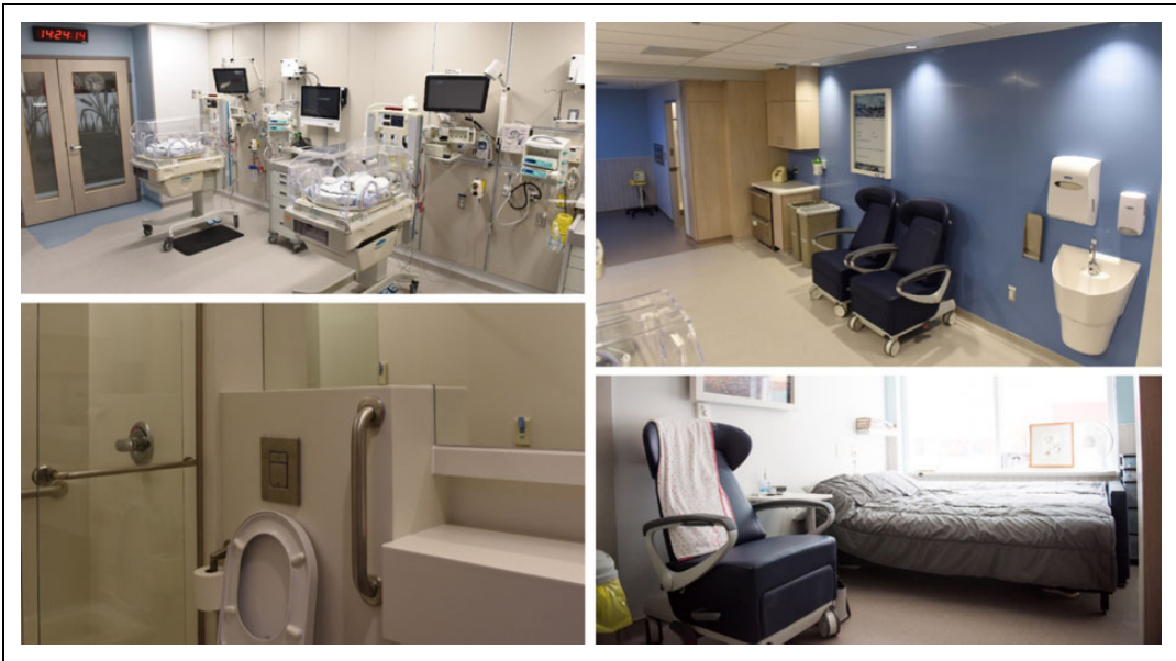
Figure 2. Images of a typical IWK Health neonatal intensive care unit single-family room.

communicated with each other using either their own personal devices or iPads provided by the NICU.