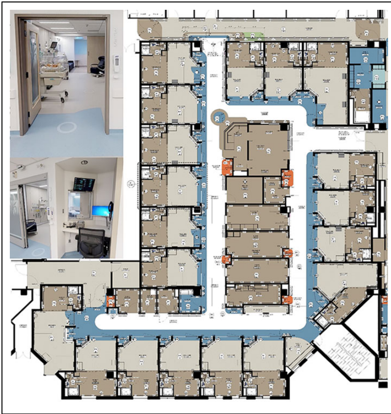
Figure 1. IWK Health neonatal intensive care unit (NICU) floor plan with typical NICU room and view of nursing station.

Level 3–4 NICU in Halifax, Nova Scotia, located in Eastern Canada. IWK Health is a perinatal and pediatric university-affiliated tertiary referral facility providing services to Nova Scotia and two nearby provinces, with approximately 800 admission (in-born and out-born) to the NICU per year. The 40-bed unit consists of single-family rooms with a designated sleep space, bathroom, and shower (Figures 1 and 2). The unit culture is underpinned by a strong FICare philosophy. The NICU team is multidisciplinary, including bedside and advanced practice nurse and nurse practitioner and nurse specialists, physicians, and allied health, including pharmacists, dietitians, social workers, lactation consultants, and physical and occupational therapists. Prior to the pandemic, parents, siblings, and other designated support people had unrestricted, 24/7 access to the NICU per the unit FICare unit philosophy (Franck