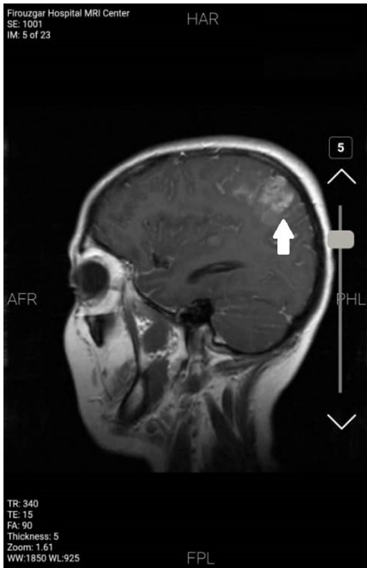
Figure 2. Brain metastasis demonstrated by T1-weighted MRI. Brain metastasis due to breast cancer indicated by T1-weighted MRI. Homogenous enhancement in the left parietal lobe could be observed.

injection of contrast agent in meningeal lesions. The results of the study showed that FLAIR sequences are more useful in infectious lesions and weighted-T1 performs better in non-infectious lesions.