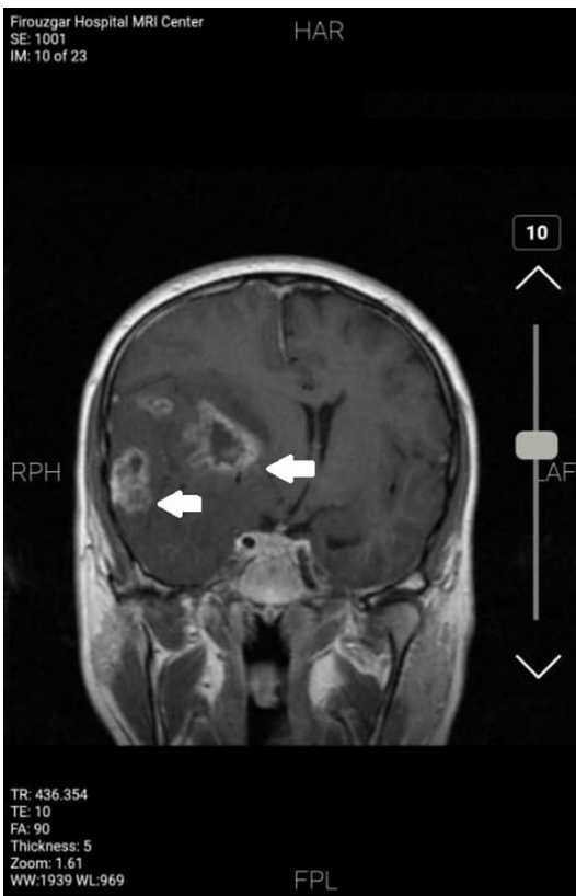
Figure 1. Brain MRI showing a tumoral lesion. The points indicate large tumor lesions (glioblastoma multiform (GBM)) in T1-weighted MRI. Heterogeneous lesions containing central necrotic and severe vasogenic edema in the environment in the right fronto-temporal lobe could be observed. The midline shift due to severe increased intracranial pressure is also observed.