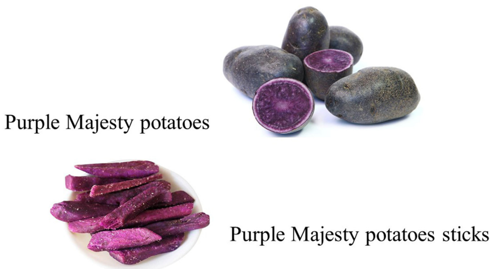
Figure 1. Purple Majesty potatoes and pre fried sticks.

previous work (Romano et al., 2021), where free fatty acids, peroxide value, total polar compounds, fatty acid composition, and volatile organic compounds have been evaluated. The flow chart for the experimental design preparation of purple potatoes is shown in Figure 2.