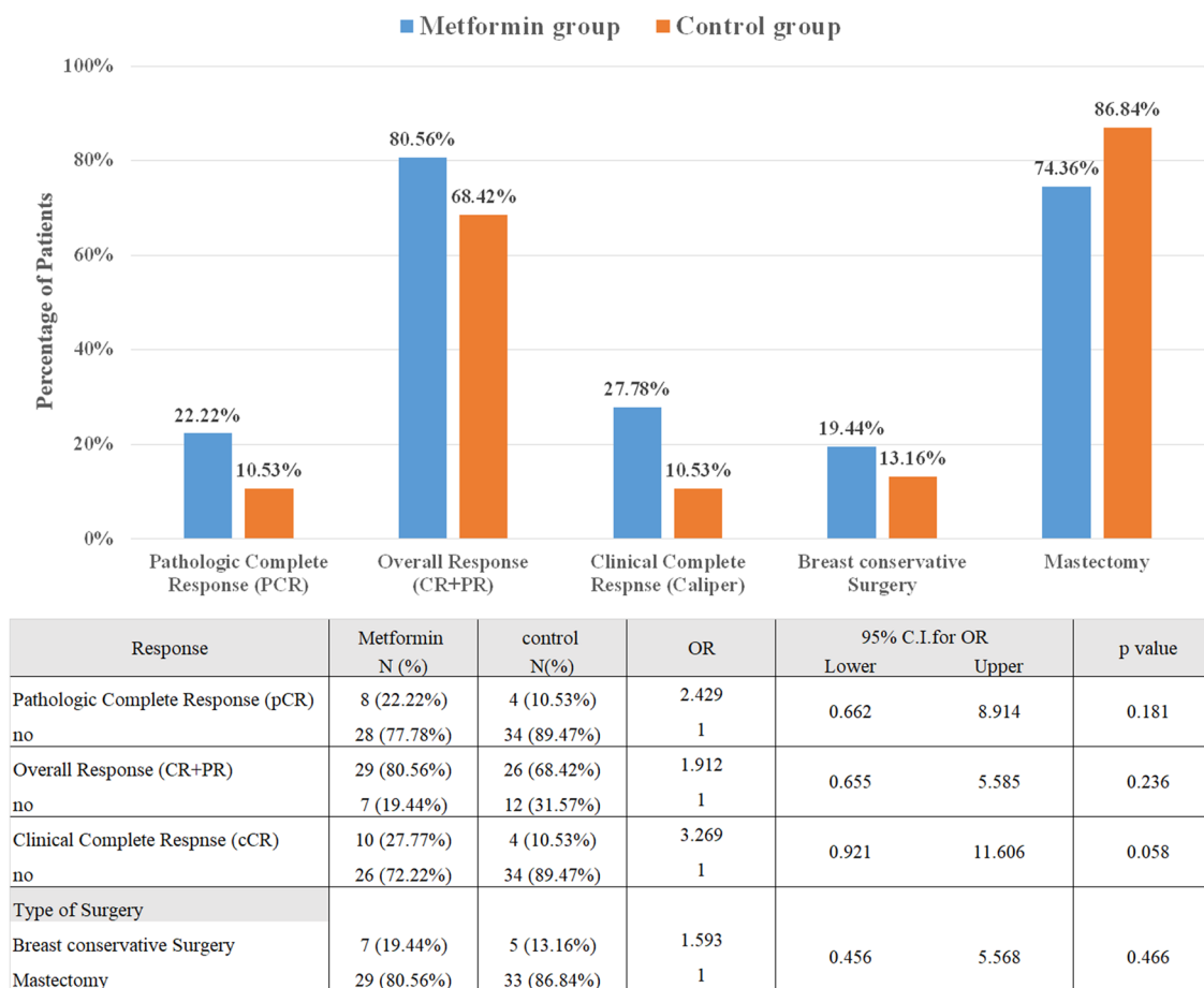
Figure 2. Effect of metformin on the different endpoints.