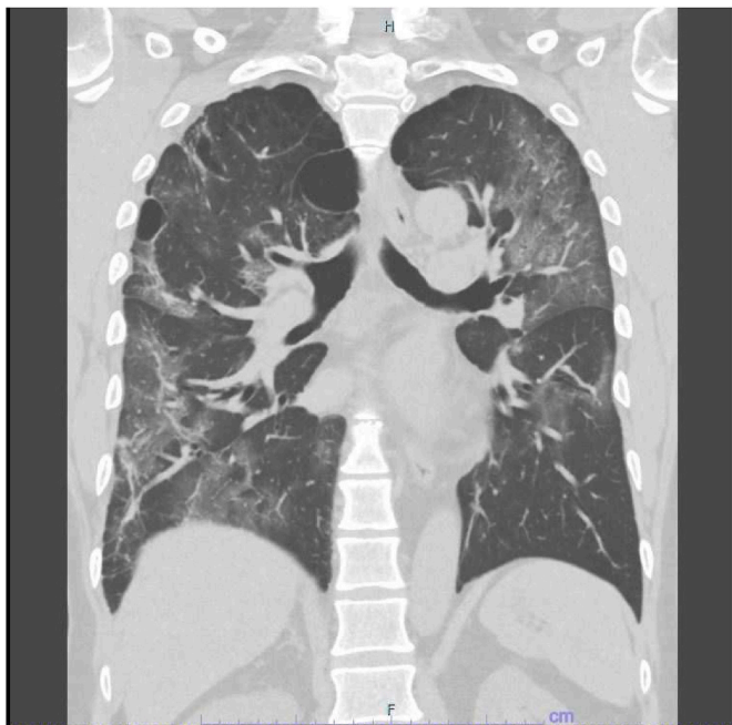
Fig. 1. Plain computed tomography. Ground-glass opacities were observed in the subpleural predominance of both lung fields.

The clinical course of the patient is shown in Fig. 2. The patient was diagnosed with severe COVID-19, and treatment with remdesivir and dexamethasone was started on admission (day 9 from onset). At the same time, 10,000 units per day of unfractionated heparin (UFH) was started by continuous intravenous infusion as a prophylactic anticoagulation therapy. Ceftriaxone and azithromycin were also administered for bacterial co-infection. The patient was changed to oxygen support with a high-flow nasal cannula because of the worsening of hypoxia within a few hours of admission. On day 4 of treatment, the respiratory status of the patient had improved, and CRP had decreased to 3.24 mg/dL. Hence, the patient was moved to an oxygen mask on day 8 of treatment. However, the D-dimer level had shown an increasing trend from day 6 of treatment (Fig. 2), and the dosage of UFH was increased sequentially. Nevertheless, the D-dimer level increased to 10 μg/mL on day 8 of treatment. The platelet count increased from 139 × 10 3 /μL to 250 × 10 3 /μL on day 4 of treatment but decreased to 104 ×