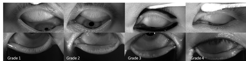
Figure 2. Representative meibography images of the four meiboscale grades.