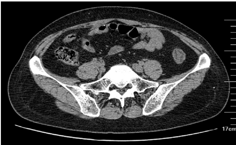
DOI: 10.12998/wjcc.v10.i12.3866 Copyright ©The Author(s) 2022.

Figure 1 Results of the computed tomography of the abdomen showing edema and bowel wall thickening with hypodensity in the sigmoid colon and descending colon.