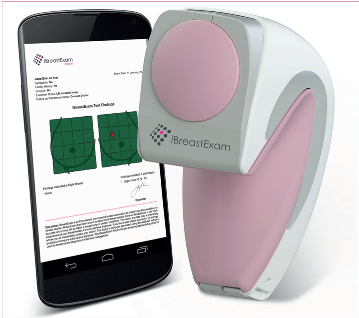
Figure 1: iBreastExam device and mobile tablet