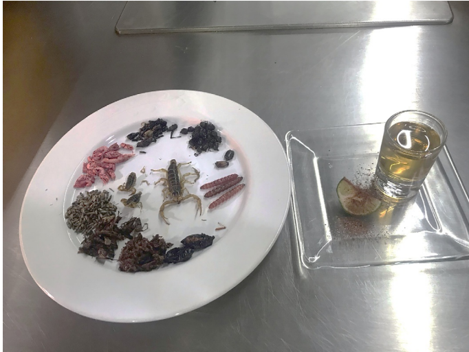
Fig. 1 Degustation plate of insects traditionally eaten by the Aztecs and still available in public markets in Mexico City. Insects, clockwise from the top, are grasshoppers (plain), chicatana ants, jumiles (stink bugs), chinicuiles (red maguey worms), cocopache (leaf-footed bug), grasshoppers (salted), grasshoppers (adobo), ahuatles or “mosco de río” (water fly), and acociles (crayfish). Scorpions are in the center of the plate.

spiritual attributes to certain insect species, such as consuming wasps for bringing prosperity, protection and abundance (Ramos-Elorduy, 2009).