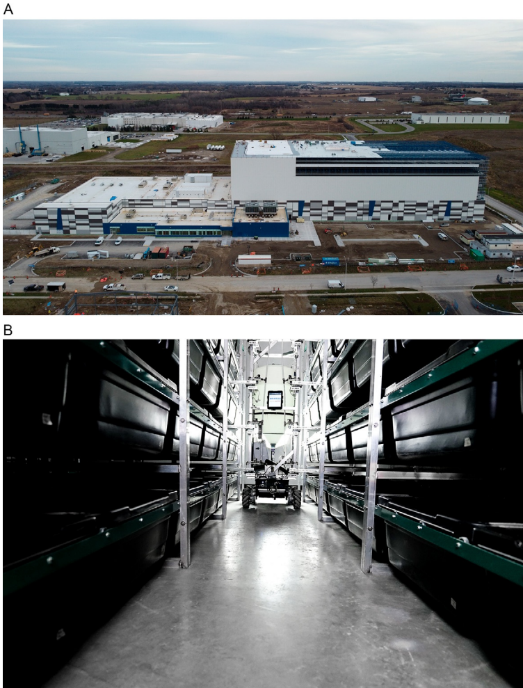
Fig. 4 (A) Aspire Food Group's 100,000sqft fully-automated cricket production and processing facility located in London, Ontario, Canada. Once operational, this landmark plant is expected to produce 10,000 tons of crickets/year. (B) An early iteration of robotic watering technology at Aspire Food Group Research & Development facility in Austin, Texas, USA.

the next 10 years (Liceaga et al., 2021). As a result of this market increase aimed toward Western cultures, other approaches to preparing insects must rely in processing methods that render insects into non-recognizable forms, like flours or powders, protein hydrolysates, fermentable substrates, etc. (Table 2) (Liceaga, 2021; Melgar-Lalanne et al., 2019). The use of different drying technologies seems to be the most commonly used approach for