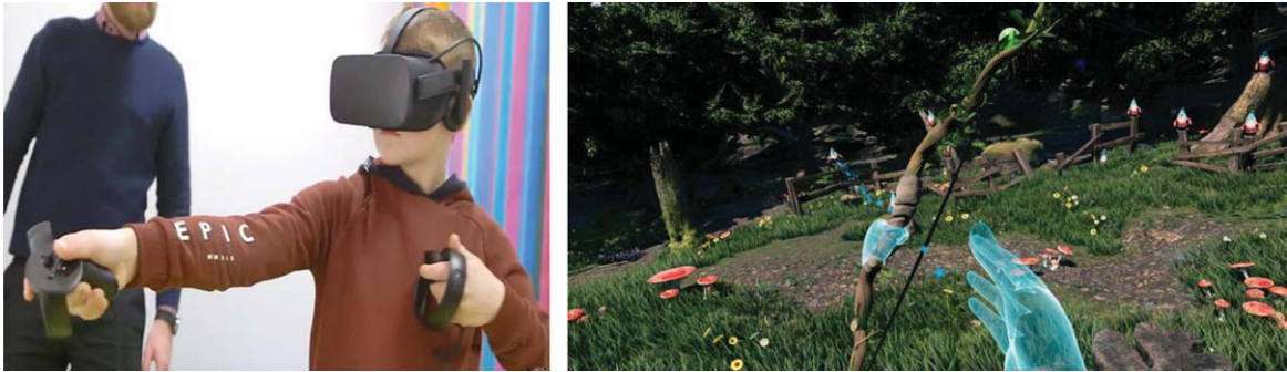
Fig. 2. Images of Archery game.

then lift up the injured arm and bend the elbow behind the back to grab an arrow from a quiver. Afterwards the child brought the arrow in line with the bow string to attach it, holding the bow outstretched and pulled back the injured arm holding the arrow.