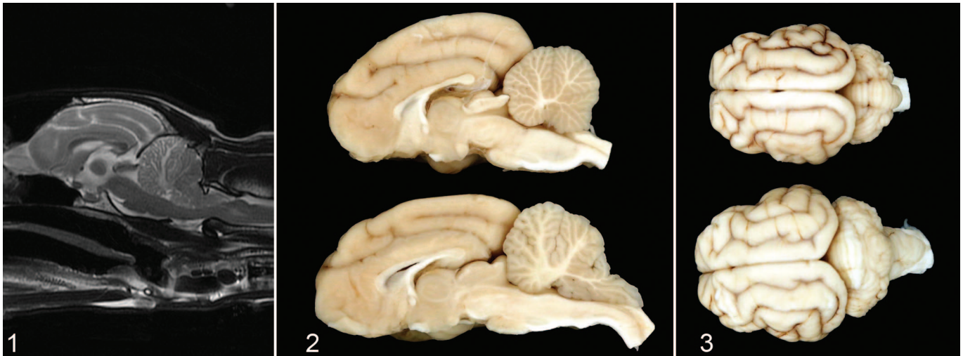
Figures 1–3. Dysplastic gangliocytoma, brain, cat. Figure 1. There is diffuse marked T2-weighted hyperintensity within the widened white matter tracts of the rostral two-thirds of the cerebellum. Magnetic resonance imaging. Figure 2. Normal (upper specimen) and dysplastic gangliocytoma (lower specimen). The architecture of the folia is maintained. White matter of the cerebellum is markedly expanded and the vermis is herniated. Figure 3. Normal (upper specimen) and dysplastic gangliocytoma (lower specimen). Markedly enlarged cerebellum with the vermis protruding and extending caudally. The gyri of the cerebrum are flattened and widened.

biochemistry values were within reference intervals. Serologic testing for feline leukemia virus, feline immunodeficiency virus, and Toxoplasma gondii was negative.