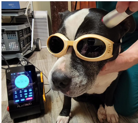
Fig. 3. Application of tPBMT to a dog using a class 4 laser. This class of laser should be used only by trained veterinary personnel.

In addition to technical considerations, there are several practical considerations to address when adapting tPBMT to dogs with CCD. Veterinary practices typically have high power medical lasers (class 3b or class 4) that require expertise and training to apply safely; lasers of these categories can treat patients very quickly, even if multiple regions require therapy (e.g., polyarthropathy). These lasers can cause thermal and retinal damage and are not suitable for home use (Bartels, 2017; Riegel and Godbold, 2017). Because of the proximity of the laser source to the eyes, the authors recommend protective eyewear for the patient when using higher power lasers (Fig. 3). It is unlikely that most pet owners will be able to transport their pets to a facility to receive tPBMT several times per week for an extended time period. Several wearable devices have been developed for treating people with cognitive decline. These devices deliver tPBMT via light-emitting diodes (LED) that contact the surface of the scalp; LED devices are very low power, compared to conventional medical lasers, so treatment sessions are fairly long (25–30 minutes) (Naeser et al. , 2014; Hennessy and Hamblin, 2017; Saltmarche et al. , 2017; Hamblin, 2019; Huang, et al. , 2020). Similar devices