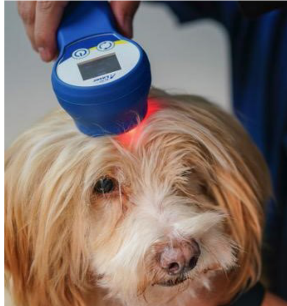
Fig. 4. Application of tPBMT to a dog using a class 1 laser.

have not been developed for dogs. Such devices would need to be available in several head sizes and may not be tolerated for the length of required treatment time in CCD patients. An alternative would be to have pet owners deliver tPBMT to their dogs at home with a small, hand-held laser unit of a lower power. Class 1 lasers do not pose the threat thermal or retinal damage and can be safely used at home by pet owners (Fig. 4). Although recommended tPBMT doses cannot be delivered as rapidly with class 1 lasers compared with higher powered devices, the authors estimate treatment times of 5–10 minutes, which may be practical for at home use. It is important to emphasize that such treatment times are estimates and that clinical trials are imperative to establish effective clinical protocols.