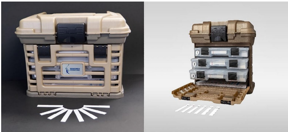
FIGURE 2 The portable Waterless Empirical Taste Test (WETT) kit with front door closed (left) and open (right). The three drawers containing the white plastic monomer cellulose pads embedded with tastants (in front of pictures) are shown. The taste strips are handed individually to each subject who self-administers the taste strips (see text for details).