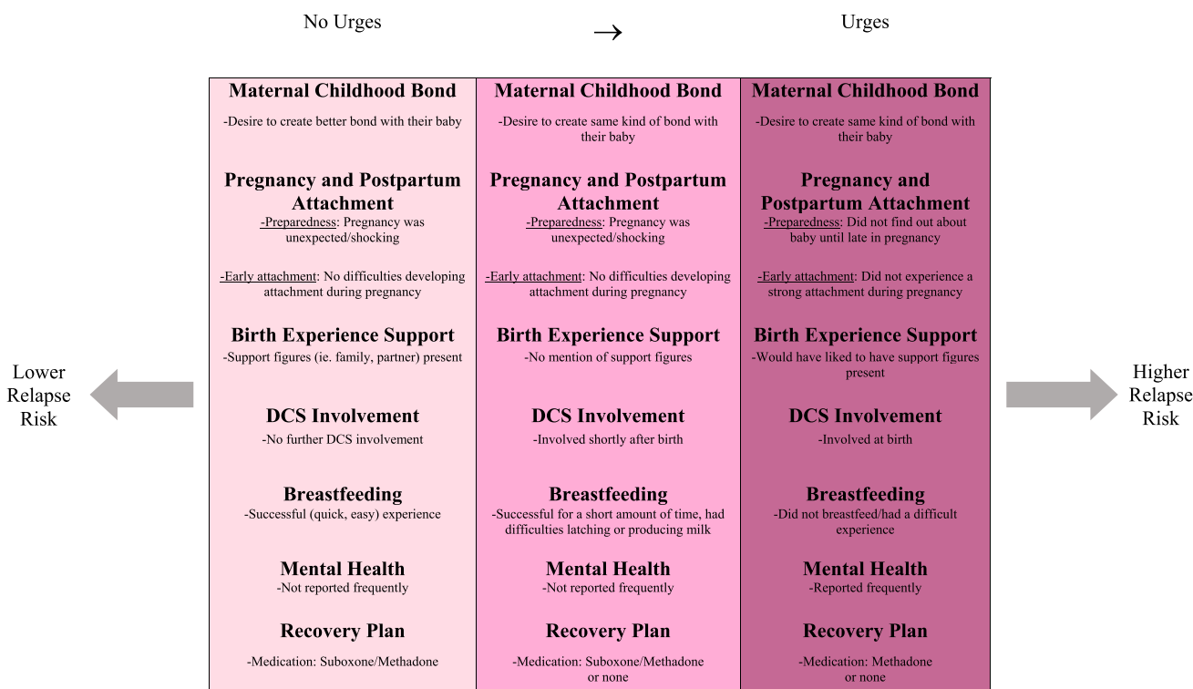
Fig. 2 Relating urges to relapse risk

have a positive bond with their mothers as children, but this motivated their desire to create a better bond between themselves and their infants. For example, Jane, aged 32, MNU, explained,