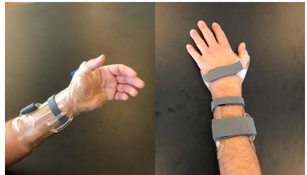
Figure 3. 3D-printed thumb spica cast for the treatment of non-displaced scaphoid fracture.

We found it to be simple and effective regarding the clinical feasibility of in-hospital production of patient-specific 3D-printed hand casts. The mean time for the entire printing workflow was 161 \pm 8 min (range 146–182). As recommended [15],