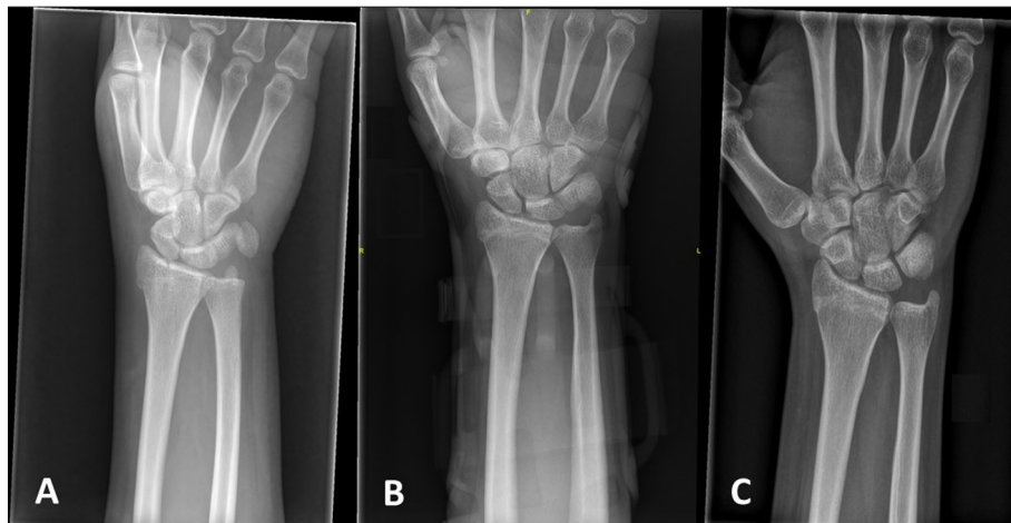
Figure 4. Radiographs demonstrating a radial styloid fracture of the right wrist at presentation to the emergency department. (A). Radiograph at the 6-week follow-up with the 3D-printed cast. Note that the fracture is not concealed, thus allowing for ideal follow-up. (B) Radiograph at 3 months showing union of the fracture with no loss of reduction. (C)