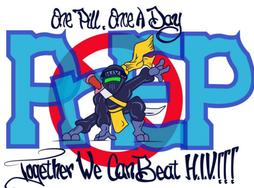
Fig. 1 PrEP marketing image developed by BHCHP PrEP program participants and a collaborating syringe service program.

Participants also described being referred to PrEP services while "getting blood work done" through street-based outreach or from the addiction treatment nurse "who sees me daily and knows about my lifestyle," representing comfortable, familiar environments. Another clinician emphasized the significance of street-based PrEP screening: "More providers