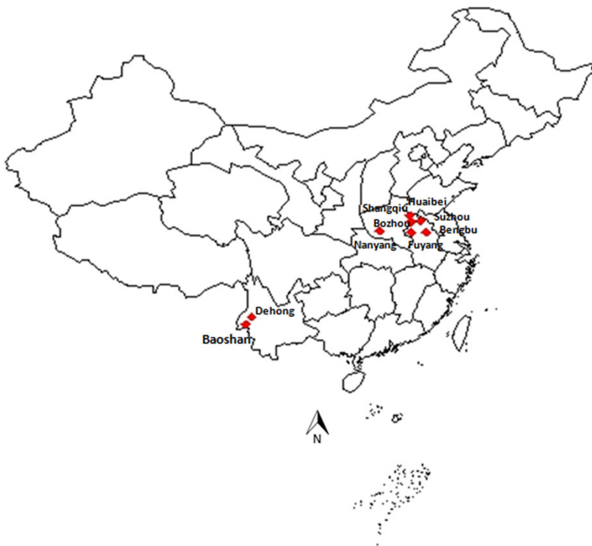
Fig. 1. Location of nine cities selected for malaria-climate data analysis in China.