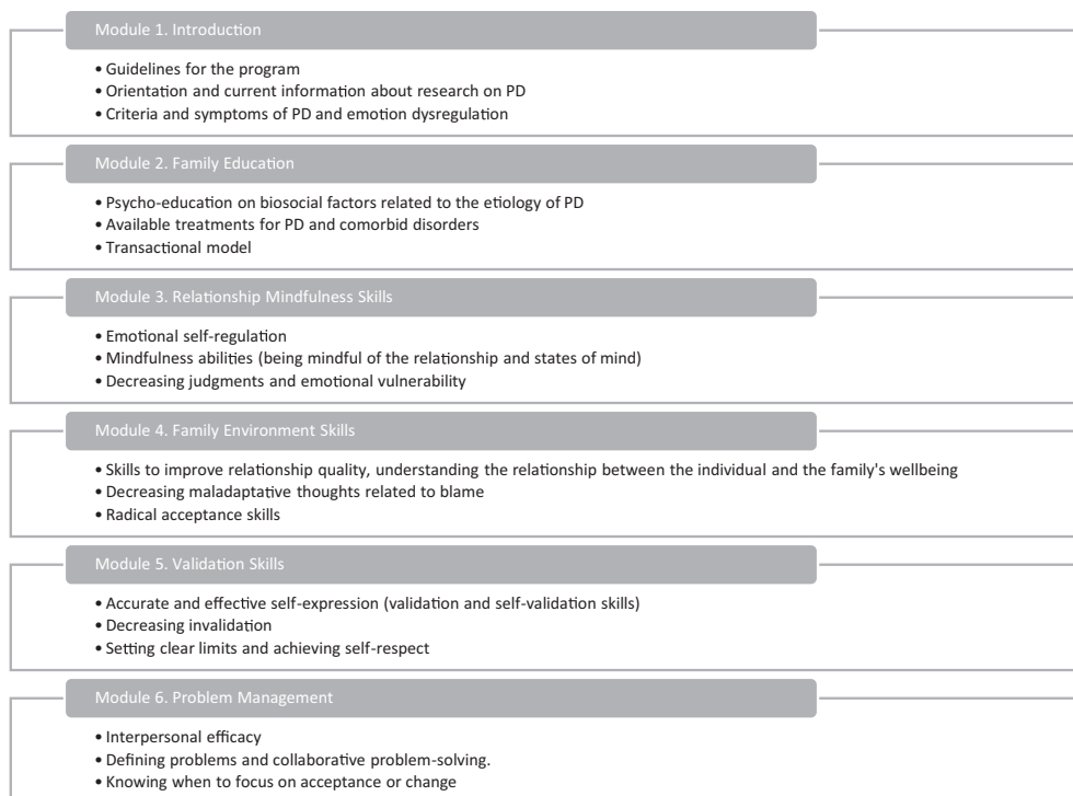
Fig. 1. Family Connections Intervention. Hoffman et al., 2005, 2007.

Regarding the sociodemographic variables of the family members, there were no significant differences between the two conditions in family members' gender ( \chi^2_{(1)} = 0.563, p = .453 ) or parentage ( \chi^2_{(5)} = 2.843, p = .724 ) before the intervention; however, the family members in the online format were younger ( t_{(43)} = 3.357, p = .002 ) than family members in the face-to-face format, and they had reached a higher educational level ( \chi^2_{(3)} = 19.492, p = .000 ) (Table 1). Regarding the sociodemographic characteristics of the patients, there were no difference in gender ( \chi^2_{(1)} = 3.240, p = .072 ) or age ( t_{(42)} = 1.196, p = .238 )