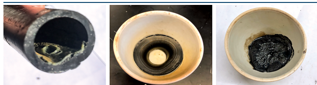
A comparison of a high-density polyethylene (HDPE) pipe (left) after the wildfire in Paradise, California, with HDPE pipes that were heated in the laboratory at 300 °C (center) and 400 °C (right).

Even after identifying the risks of plastic in water-delivery systems, Whelton is not opposed to such pipes, which are durable, inexpensive, and earthquake resistant. “There is a place for these materials,” he says, “but if you’re going to use them, you need to know where they’re vulnerable and where you need to protect them.” Protections for service lines include burying them deeper to insulate them against the heat of fires. Protections against contamination originating from both pipes and smoke include installing a network of isolation valves to keep contaminants from spreading throughout a water system, as well as devices to help keep contaminated water from moving from a burned house into the distribution system. As part of the city’s plan for rebuilding the community, the Paradise Irrigation District opted for the latter, replacing contaminated service lines with HDPE pipes outfitted with backflow preventers.