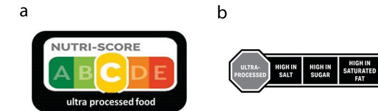
FIGURE 1— Two Suggestions for Front-of-Package Warning Labels for Ultra-Processed Foods

Note. Figure 1a: Ultra-processed added to the Nutri-Score label; this summarizes a food product’s composite balance of nutrients and ingredients. The color-coded scores range from the healthiest—A (dark green—very healthy) to B (light green), C (yellow), D (orange), and E (red—best to avoid). 29 Figure 1b: Ultra-processed added to warning labels about salt, sugar, and saturated fat used in Latin American and other countries. 30