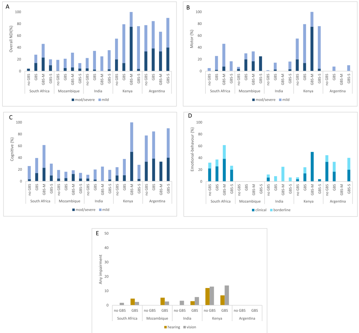
Figure 3. Multi-domain and domain specific impairment among non-iGBS children, any iGBS, GBS-sepsis, and GBS-meningitis, stratified by country. Proportion of children with different NDI outcomes in South Africa, Mozambique, India, Kenya, and Argentina for GBS exposed and unexposed children. (A) Overall impairment (moderate/severe and mild). (B) Motor impairment (moderate/severe and mild). (C) Cognitive impairment (moderate/severe and mild). (D) Emotional-behavioural problem (any problem in clinical range). (E) Hearing and vision impairment (any impairment). GBS=group B Streptococcus. GBS-M=GBS meningitis. GBS-S=GBS sepsis. NDI=neurodevelopmental impairment.

GBS-meningitis had a 15.0% (3.4% - 30.8%) risk of moderate/severe NDI (Table 3).