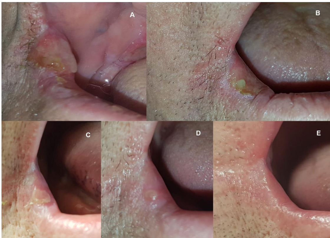
Figure 3. Views of the ulcer in the right labial commissure just before the 1st PBM treatment (A), on the 4th day before the 2nd PBM (B), on the 7th day before the 3rd PBM (C), on the 14th day before the 5th PBM (D), and on the 21st day before the 7th and last PBM treatment (E).