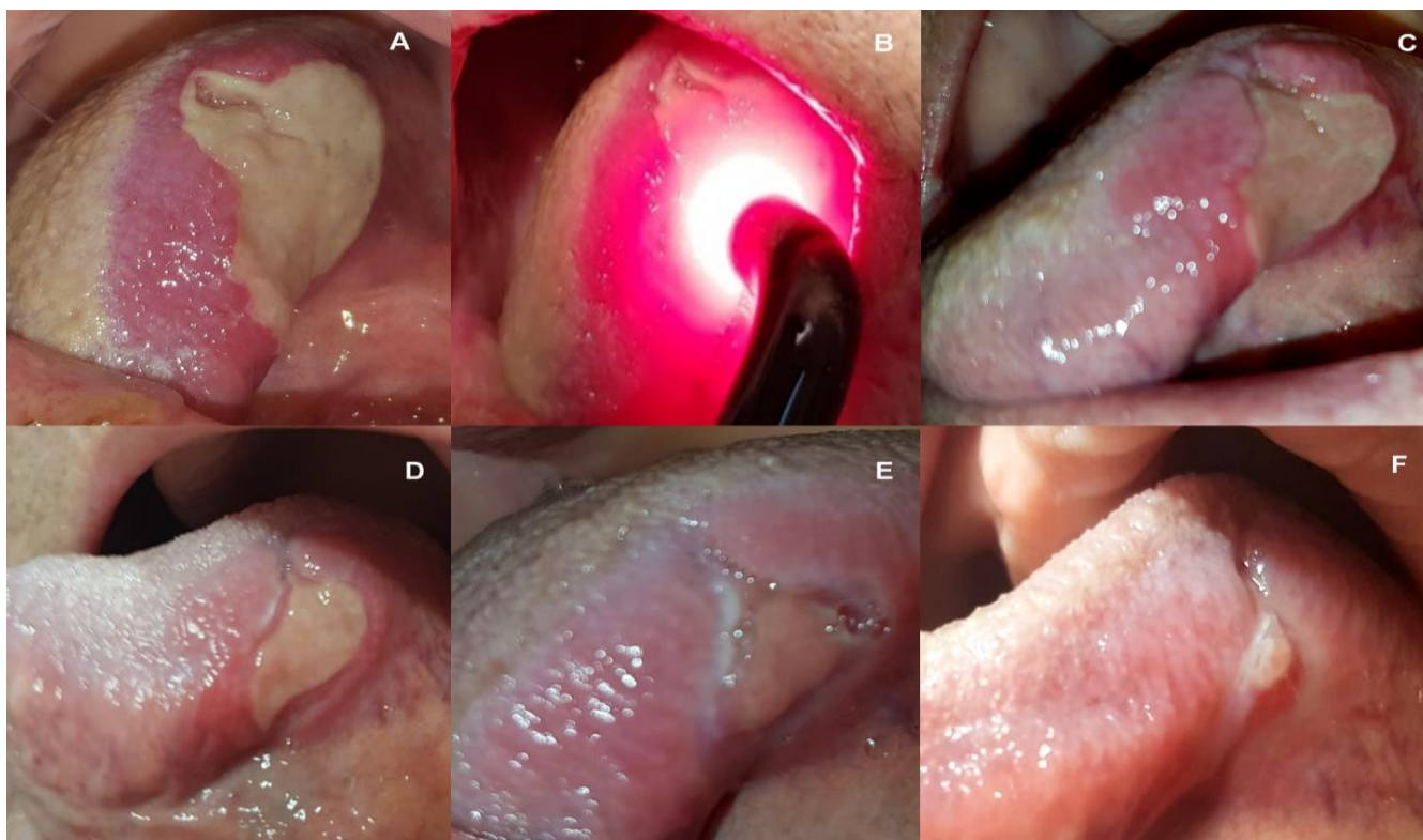
Figure 1. Images of the extensive ulceration on the left lateral surface of the tongue, just before the 1st PBM procedure (A), during the 1st PBM (B), on the 4th day after the 1st irradiation, and before the 2nd PBM (C), on the 7th day before the 3rd PBM treatment (D), on the 14th day after the first treatment before the 5th PBM (E), and on the 21st day before the 7th and last PBM treatment (F).