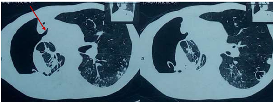
Fig. 3 Computed tomography scan segments showing bronchopleural details. Computed tomography scan segments showing details of bronchopleural fistula in the right hemithorax (arrow), pyo-pneumothorax, partial right middle and lower lung lobe collapse, and thick-walled cavity in the right upper lobe of the right hemithorax

pulmonary complications (bronchopleural fistula and pyo-pneumothorax) was taken over by the cardiothoracic surgeons, who maintained the chest tube drainage. The patient continued his MDR-TB treatment and ART as prescribed and was monitored for any complications that could arise from presence of a bronchopleural fistula, especially tension pneumothorax. The patient continued to be ill with respiratory symptoms, right chest pain, and occasional difficulty in breathing. Although a repeat CXR had indicated improvement in the pneumothorax after diagnosis of the bronchopleural fistula and management with a chest tube, a CXR (Fig. 1e) performed a month later showed recurring pneumothorax.