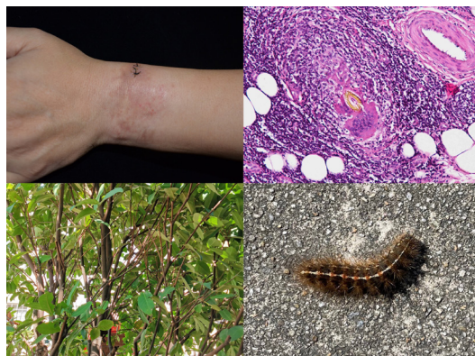
Figure 1 Top left: the clinical appearance of the affected area after biopsy; bottom left: the wax apple tree in the patient's yard; top right: histopathological image of the caterpillar setae; bottom right: the caterpillar found in the patient's yard.