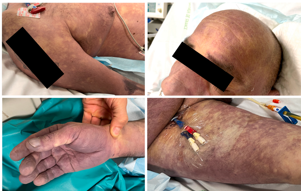
Fig. 1. Skin examination revealing an extensive and marked non-blanching rash of the trunk, head and limbs.