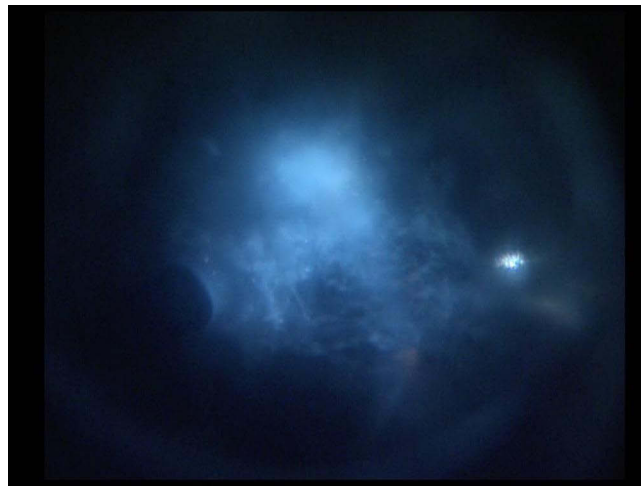
Figure 1 Diffuse vitreous opacification illuminated intraoperatively.