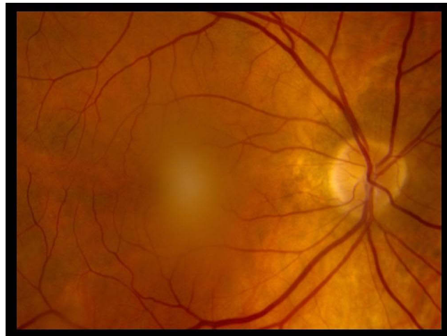
Figure 2 Fundus photograph showing a single, focal SVO in the central, posterior vitreous that was highly symptomatic and non-resolving.

(OCT, Figure 3A and B ). A full discussion of DVS symptomatology and 28 examples of patient statements can be seen at http://floaterstories.com